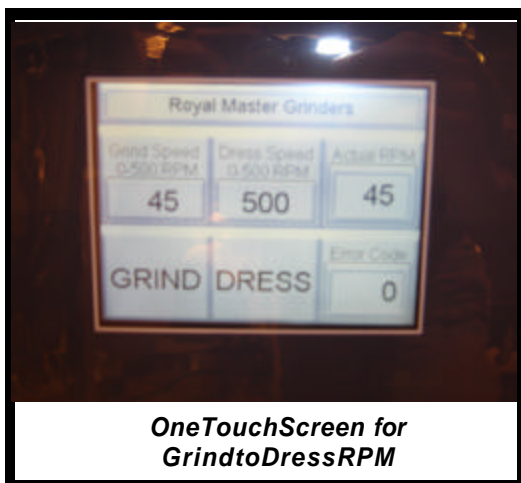
One Touch Screen for Grind to Dress RPM